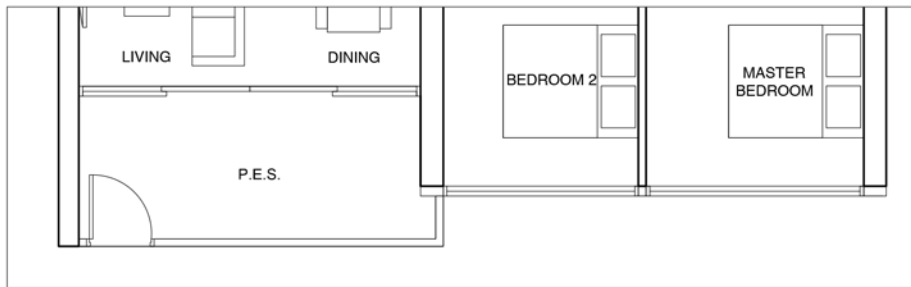
Applicable to Type (3y)a1 only